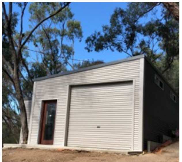
There is still a lot to do but it's getting there!