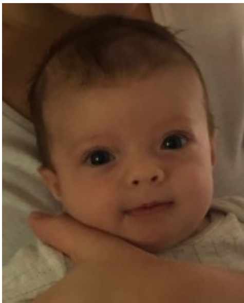
Isn't she the cutest little poppet!

As well as my classes at The Glass Emporium I am planning to hold a class at my new studio in Blackwood one day per week. You will be able to work with any medium of your choice at these classes. My studio is still a couple of months away from being finished but I would love to get an idea if anyone is interested in coming to Blackwood for a class and if so what day would interest you? I would also like to know if anyone would be interested in doing intensive 2 or 3 day workshops at my studio.